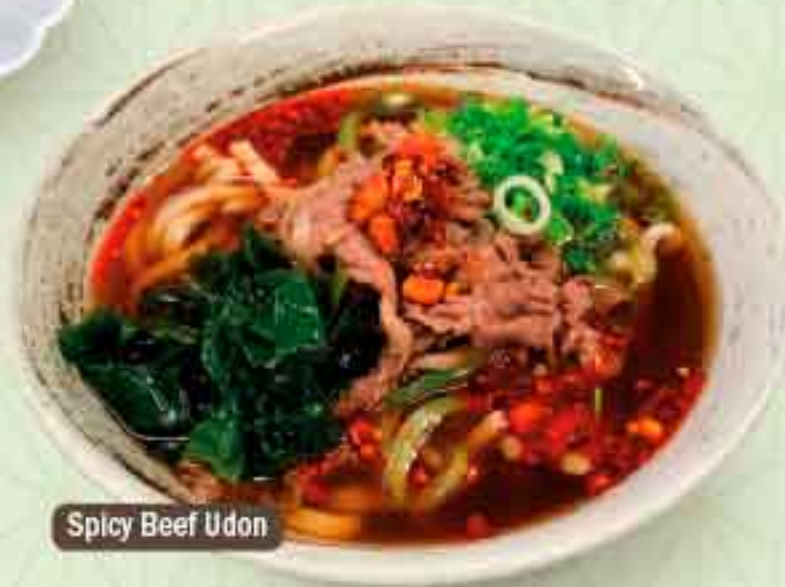
Spicy Beef Udon