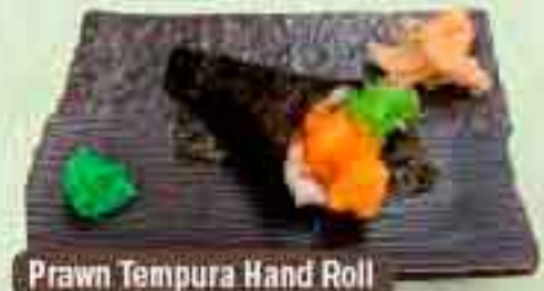
Prawn Tempura Hand Roll

Chicken Teriyaki Hand Roll / incl. lettuce, mayo 6.5