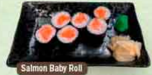
Salmon Baby Roll

Cooked Tuna Baby Roll / incl. mayo GF 5.5