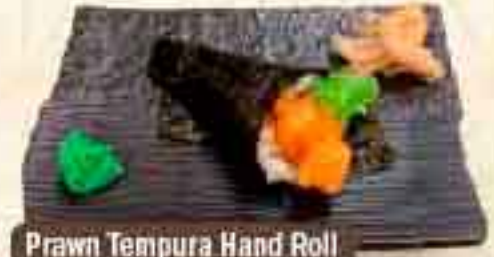
Prawn Tempura Hand Roll

Chicken Teriyaki Hand Roll / incl. lettuce, mayo 6.5