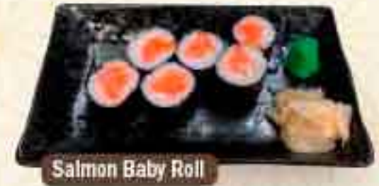
Salmon Baby Roll

Cooked Tuna Baby Roll / incl. mayo GF 5.5