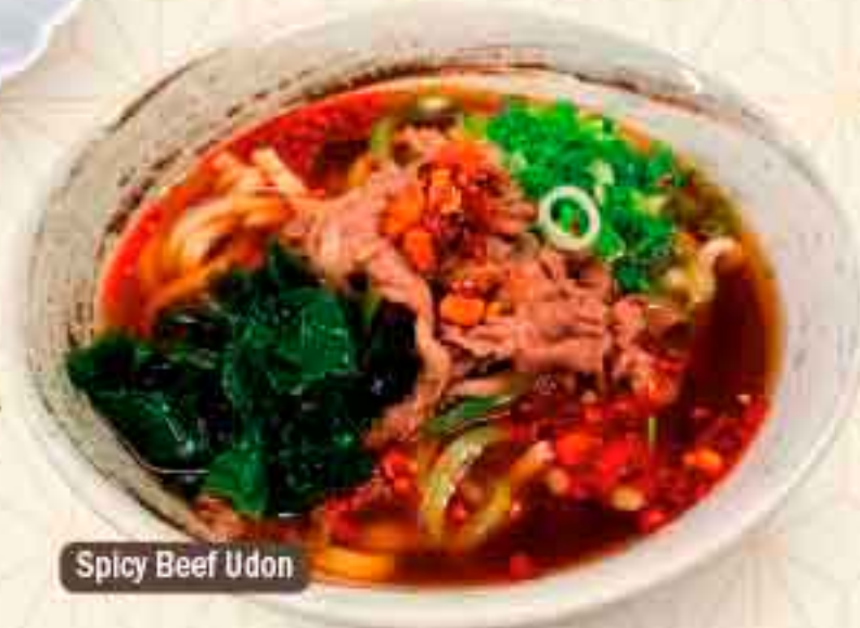
Spicy Beef Udon